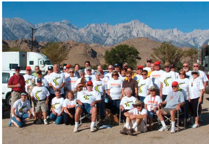
Some 2008 Whitney Classic workers with Mt. Whitney in the background.